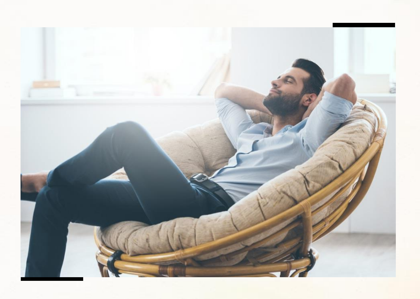
A unit of IBS